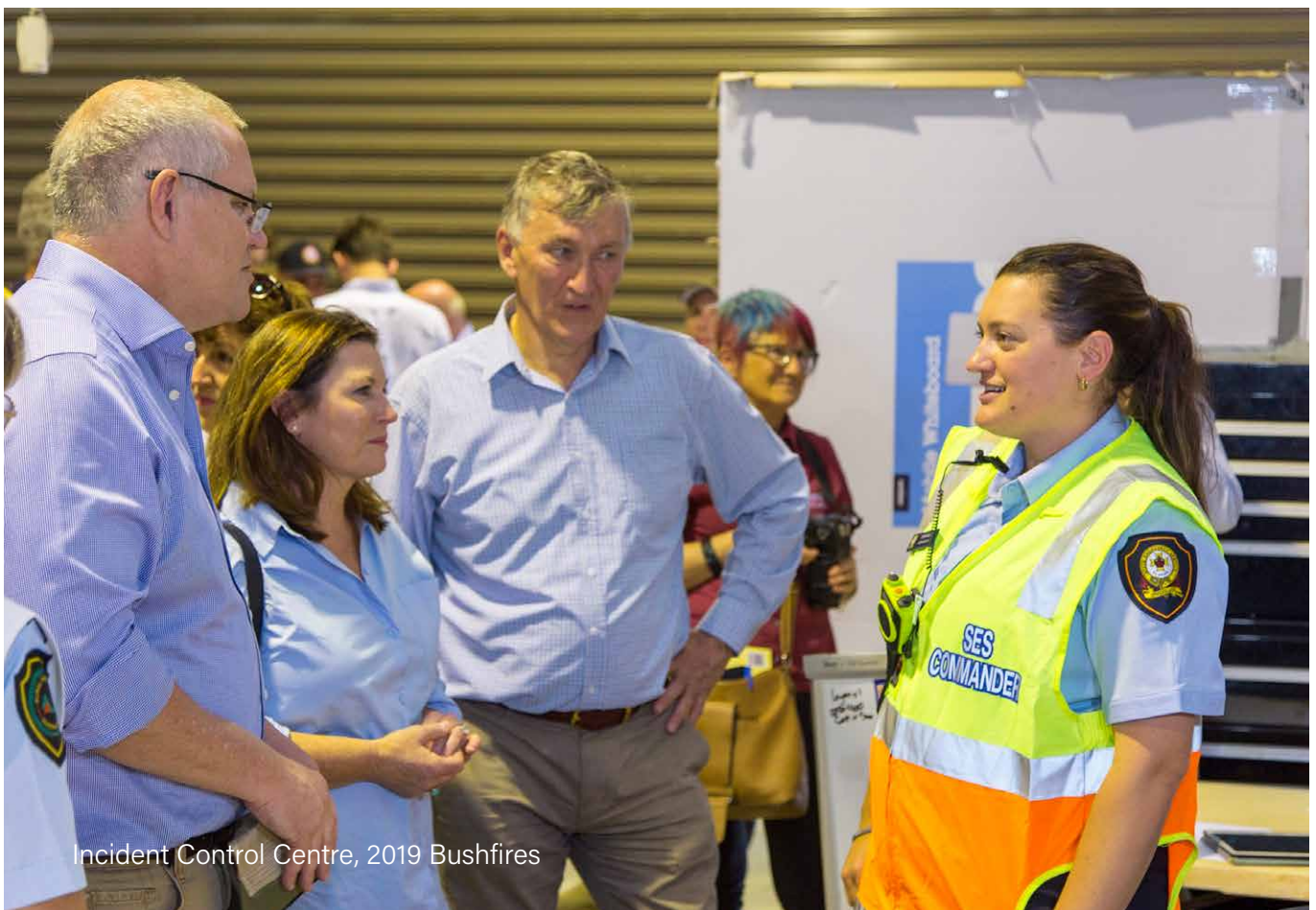
Incident Control Centre, 2019 Bushfires