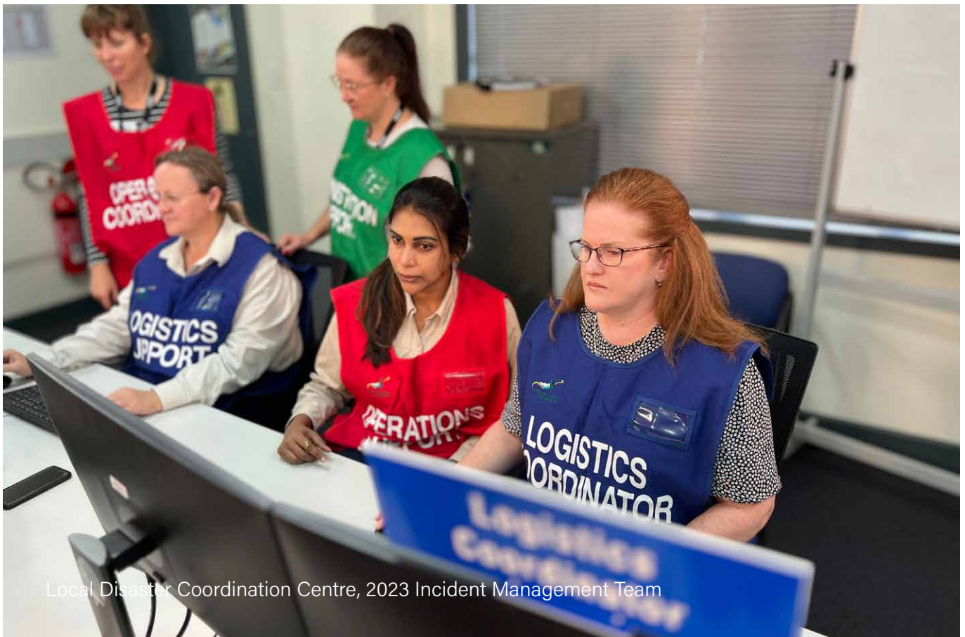
Local Disaster Coordination Centre, 2023 Incident Management Team

been adopted by the Group. Adoption of draft minutes are noted at each quarterly meeting. Recording of activated Scenic Rim Local Disaster Management Group meetings will also occur to assist in transcribing and will be disposed of accordingly.