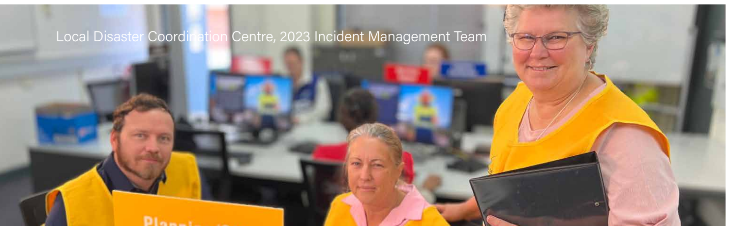
Local Disaster Coordination Centre, 2023 Incident Management Team