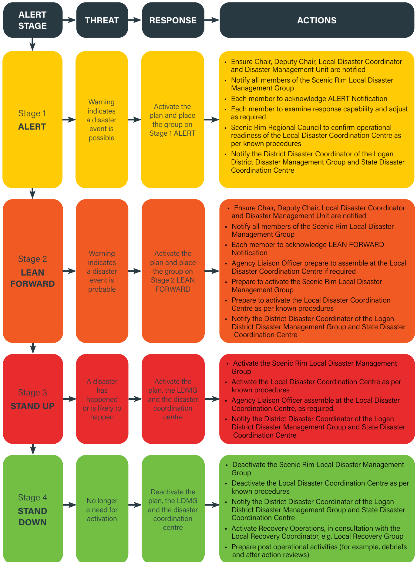
Figure 1: Activation of Disaster Management Arrangements