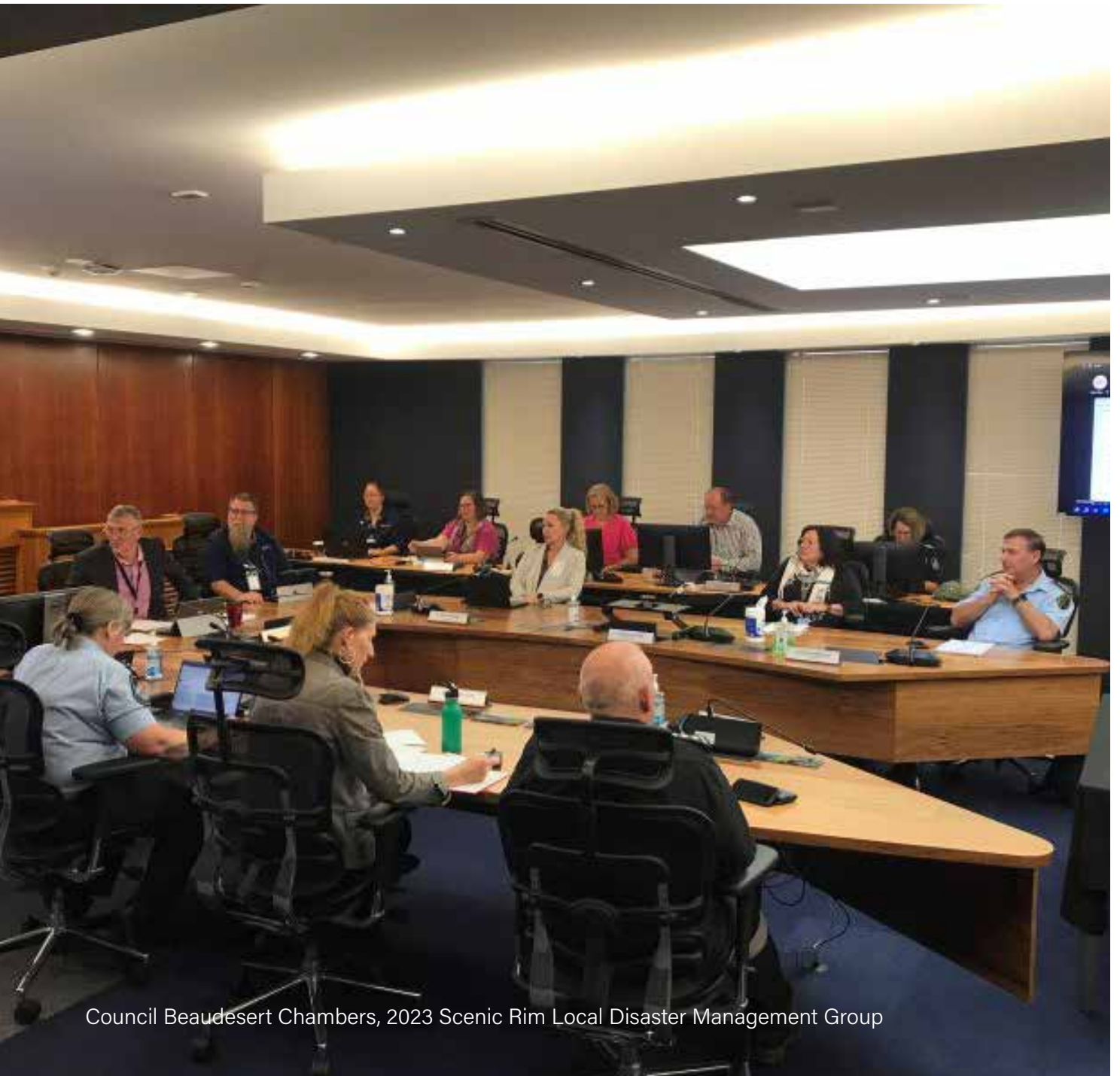
Council Beaudesert Chambers, 2023 Scenic Rim Local Disaster Management Group

This Terms of Reference and Guide is distributed to all persons listed in the Scenic Rim Local Disaster Management Group (LDMG) contact list, as members, advisors or observers.