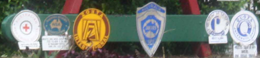
Beaudesert, 2011 Flooding