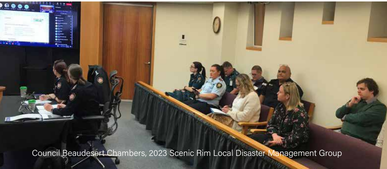
Council Beaudesert Chambers, 2023 Scenic Rim Local Disaster Management Group

Mayor, Scenic Rim Regional Council Chair, Scenic Rim Local Disaster Management Group